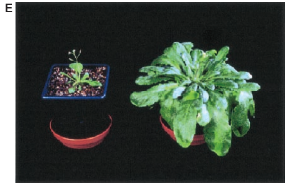
Fig. 1. Cloning of FRIGIDA . (A) Genetic interval, molecular markers, recombination positions, and yeast and bacterial artificial chromosome (YAC and BAC) clones covering FRI . Markers with mi and CC prefixes are described in (22), and those with UJ prefixes are new CAPS (cleaved amplified polymorphic sequence) markers distinguishing H51; Col DNA, 40D10, and 32F5 are H51 cosmids. Breakpoints in different recombinants are indicated at ends of horizontal arrows. IGF and TAMU BAC clones carry F and T prefixes, respectively. The different YAC clones are prefixed CIC, EW, EG, and YUP. The vertical lines and rectangles represent the extent of the region covered by the respective marker (17). (B) H51 cosmid clones covering the BAC clone F6N23. Cosmids complementing the flowering time phenotype (i.e., changing it from early to late) are shaded in red. (C) Subclones of cosmid 84M13, with complementing subclones in red. JU235 is an internal deletion of 84M13. The number of late-flowering individuals per number of transformants generated is indicated at the right. (D) Extent of deletions and rearrangements in three fast neutron-induced early-flowering mutants, FN13, FN233, and FN235 [from a population of >40 early mutants in the FRI ( Sf-2 ), FLC-Col background (9)]. Southern analysis showed that FN233 and FN235 carried intact FRI promoter regions but lacked most of the coding region of FRI . FN13 could be interpreted as having an insertion or a complex rearrangement within a 600-bp Pst I– Sac I fragment of exon 1 of FRI , internal to the Sca I fragment missing in subclone JU235. (E) Introduction of H51 FRI allele into Li5.

Wild-type Li5 is shown on the left. A late-flowering primary transformant following Agrobacterium -mediated transformation of Li5 with the cosmid 84M13 is shown on the right. Both plants were photographed once they had flowered (after ~3 months for the transformant and 3 weeks for the parent).