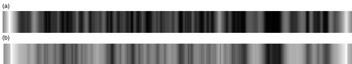
Figure 2. Snapshot of the DivIVA (top) and MinD (bottom) membrane density profiles at length 10 \mu\text{m} . White (black) corresponds to areas of high (low) concentration. Note that these are one-dimensional simulation results (two-dimensional presentation in the Figure is for clarity).

More quantitative data, with profiles of the